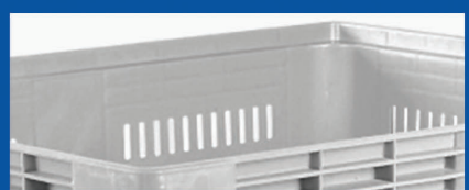
Perforated four sides