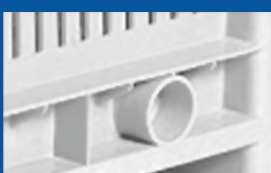
All four sides have drains and taps can be added