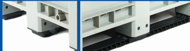
Pallet base is four way entry