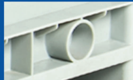
All four side have drains and taps can be added