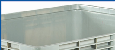
Smooth inner surface