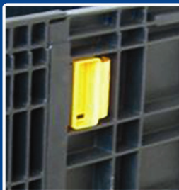
Drop door latch