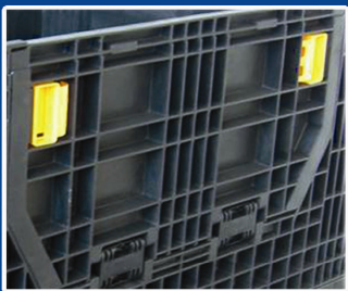
Three drop doors on two short sides and one long side